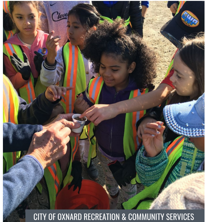
CITY OF OXNARD RECREATION & COMMUNITY SERVICES